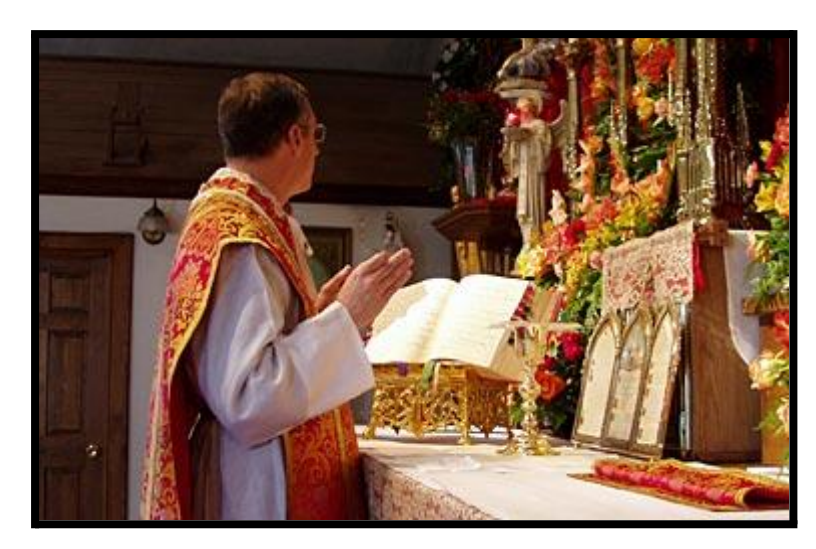
The Priest now prays the prayer of Our Lord, with hands apart, thumb and forefinger held together.

At the Saviour's command and formed by Divine teaching we dare to say: