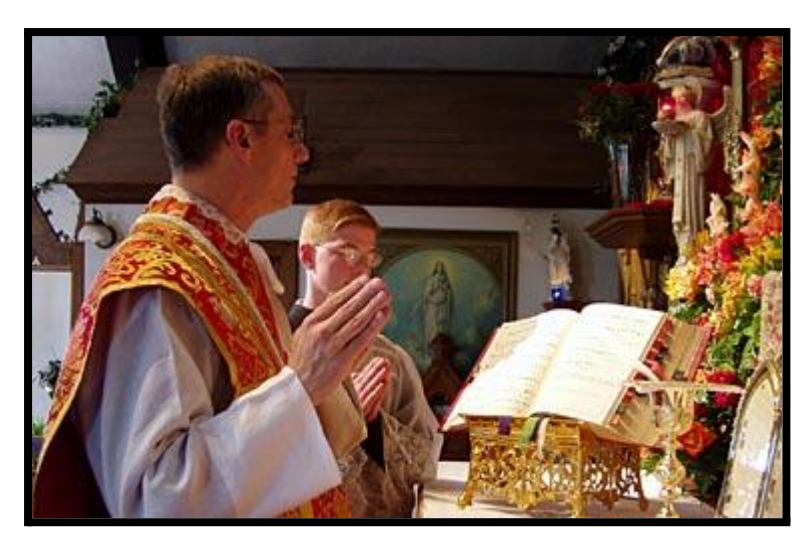
After the Secret prayers, which are proper to the Mass of the day, the Priest recites aloud the most solemn words of the Preface .

The Lord be with you And with your spirit .