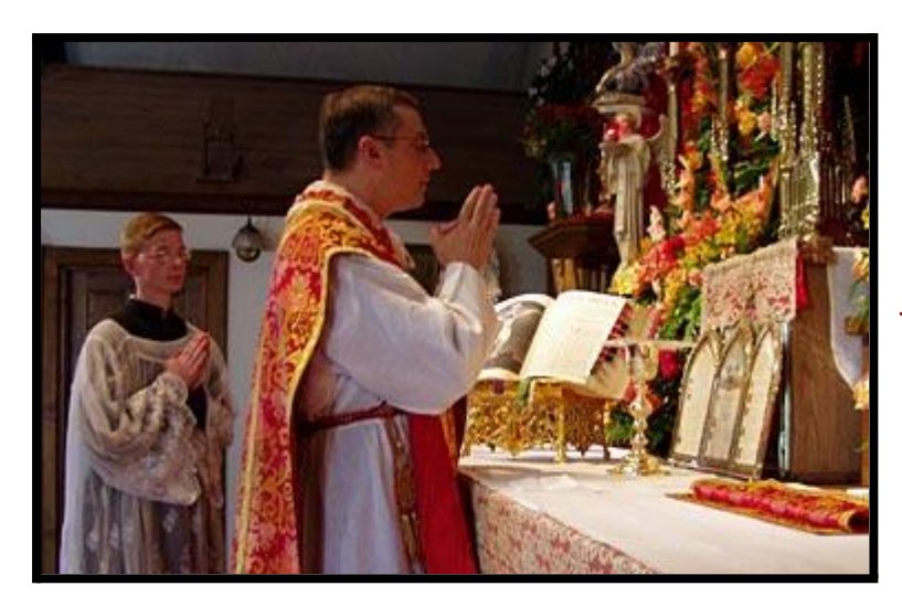
The Commemoration of the Living asks God to be mindful of all the faithful here present, their families and friends, that He might grant them the salvation of their souls and the health and welfare for which they hope.

Therefore with angels and archangels, and with thrones and dominions and with all the heavenly hosts, we sing a hymn to Your glory, saying without ceasing: Holy, Holy, Holy, Lord God of hosts, Heaven and earth are full of Your glory: Hosanna in the highest.