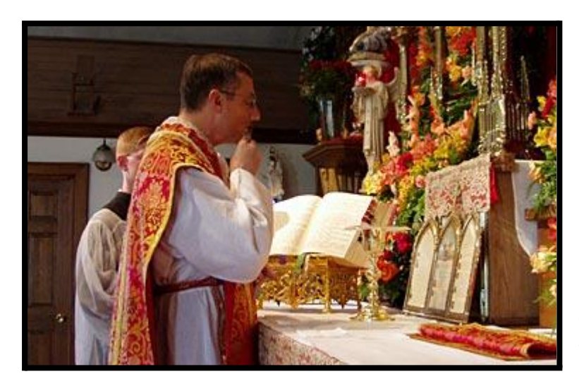
The Priest concludes the prayer and breaks the Host.