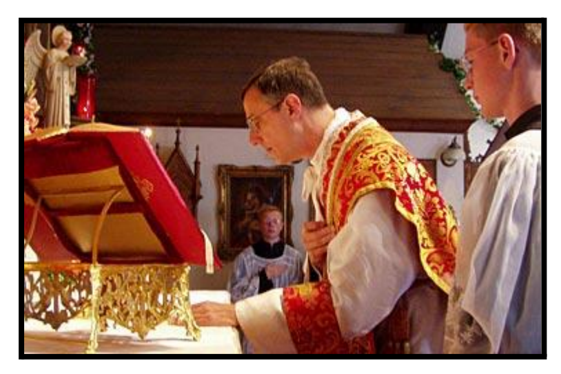
Bowing down, the Priest strikes his breast three times as a sign of contrition and humility, saying the threefold Lamb of God , who takes away the sins of the world, have mercy upon us, grant us your peace.