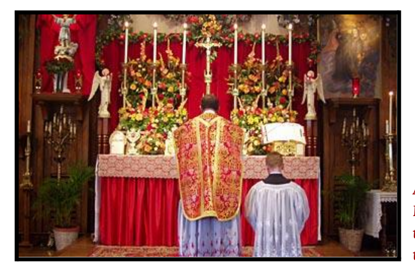
After the Absolution , the priest Bows slightly and makes an appeal to God's mercy before ascending to the Holy of Holies: